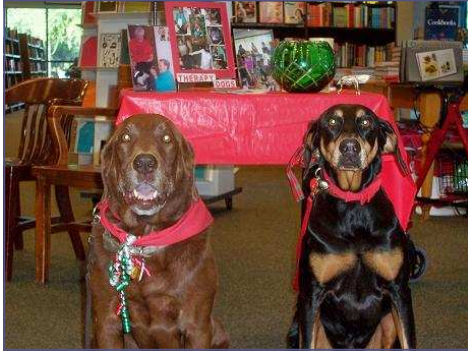
Charlye and Demi reporting for duty