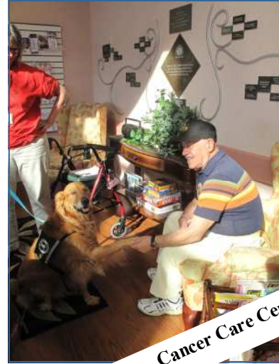
Kala... Cancer Care Center