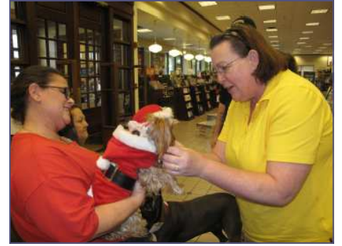
Skeeter greeting customers