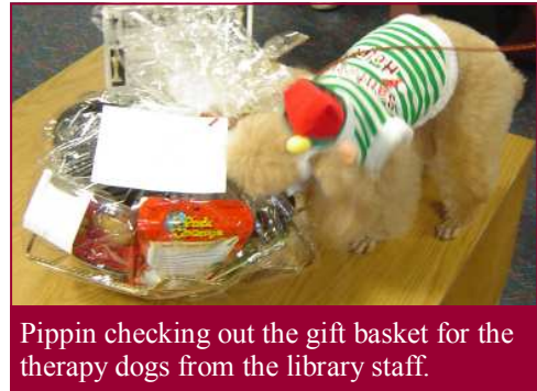
Pippin checking out the gift basket for the therapy dogs from the library staff.