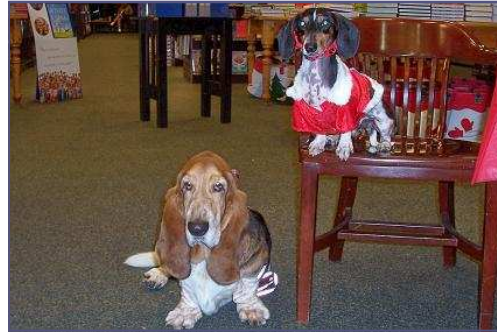
Crusher and Bingo ready for the next shift